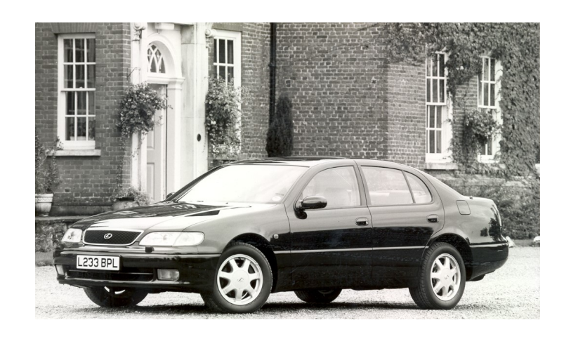
The Lexus GS 300 was launched in 1993.

The LS 400 remained Lexus's sole standard-bearer in Europe until 1993 and the launch of the GS 300 luxury performance saloon. Since then the model range has grown steadily to give Lexus a presence in many areas of the prestige car market.