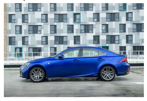
The IS became one of Lexus's best-selling models in the UK following its launch in 1999.

The first generation IS executive sports saloon joined the European line-up in 1999, followed by the RX luxury SUV a year later.