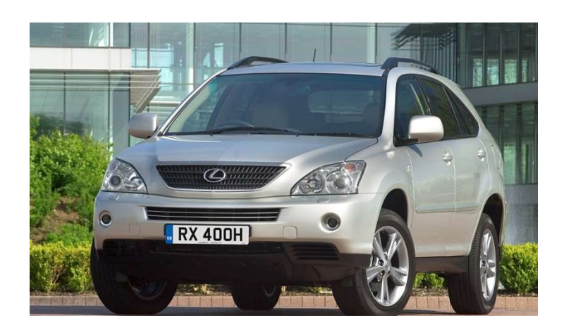
The original Lexus RX 400h.

In 2005, the RX range took Lexus into the field of self-charging hybrid power technology with the launch of the RX 400h. This introduced Lexus Hybrid Drive, featuring a 3.3-litre V6 petrol engine and compact but powerful electric motor. In performance terms, it was a match for rival V8 petrol-engine competitors, while its fuel economy and exhaust emissions were on a par with a conventional family saloon.