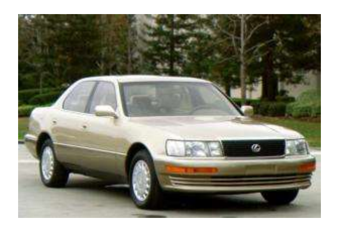
The LS 400 was the first Lexus model to be sold in the UK.

Lexus made its debut in Britain in 1990, following the marque's international launch in North America the previous year. In terms of scale, its beginnings were modest: just one model was offered for sale, the LS 400 limousine. Its impact, however, was exceptional, changing people's perception of what a luxury car should be.