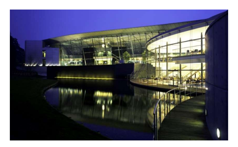
Lexus's headquarters building in Epsom, Surrey.

Lexus is a division of Toyota (GB) PLC. It is responsible for the marketing of the Lexus brand in the UK and supporting the national network of Lexus retailers. Its central UK office is at the Toyota headquarters, a state-of-the-art building near Epsom, Surrey.