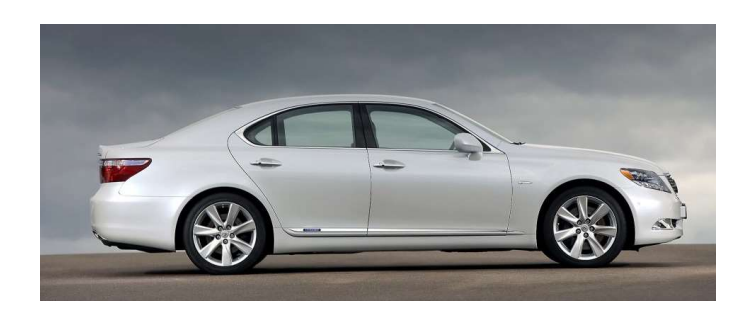
The LS 600h, the flagship of the Lexus range in 2007.

In 2009 the RX 400h made way for an all-new RX 450h with a revised Lexus Hybrid Drive system that delivered improved CO<sub>2</sub> emissions and fuel economy, outperforming all diesel and petrol-powered rivals in the luxury SUV segment.