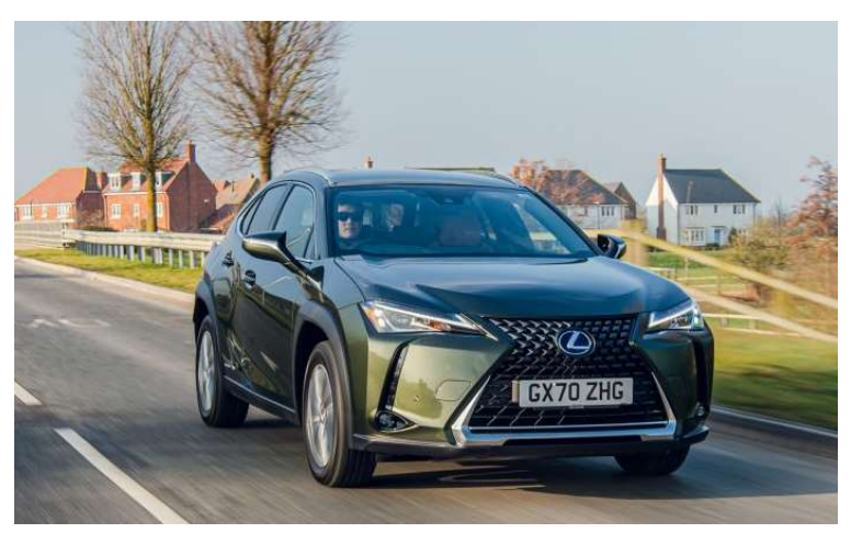
The Lexus UX 300e

In 2019, Lexus revealed its first battery electric vehicle (BEV), the UX 300e. This electric version of the compact SUV went on sale at the end of 2020. At the same time, the company